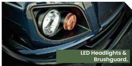
LED Headlights & Brushguard.