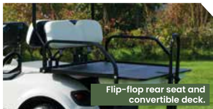
Flip-flop rear seat and convertible deck.