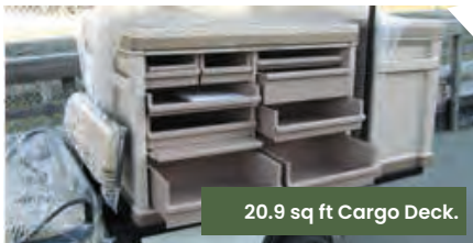
20.9 sq ft Cargo Deck.