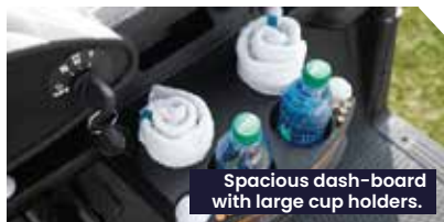
Spacious dash-board with large cup holders.