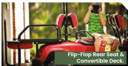
Flip-Flop Rear Seat & Convertible Deck.