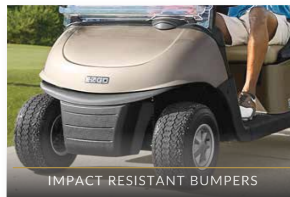
IMPACT RESISTANT BUMPERS