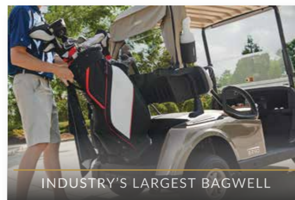
INDUSTRY'S LARGEST BAGWELL