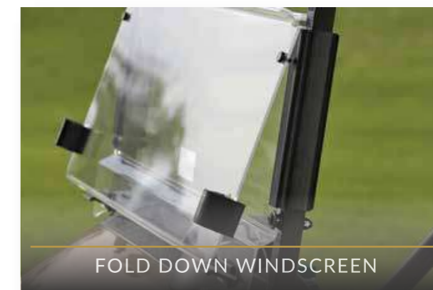
FOLD DOWN WINDSCREEN

E-Z-GO have made a product that is attractive, with a high overall quality & feel and offers premium features that clubs & golfers find invaluable.